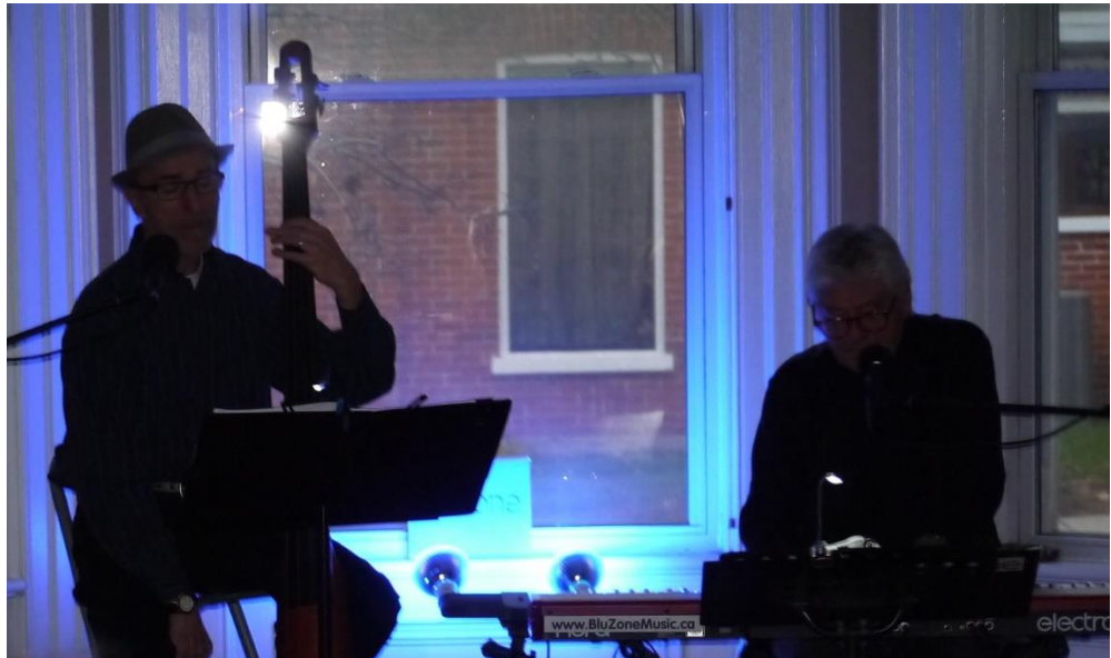
BluZone entertained in Dec 2015

Since John's 2008 report, there have been 93 meetings of Chapter 29 between Jan 2009 and October 2016. The seven Christmas gatherings have included two more theatrical productions by our own thespians and two sets of musical entertainment alternating with wine and cheese parties in the pattern established since 2004.