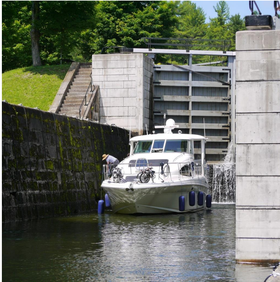
Locks At Jones Falls

Looking forward, chapter members and friends can help sustain the vitality of the group with feedback about what we should continue doing, what to do more – or less – often, what new things to try.