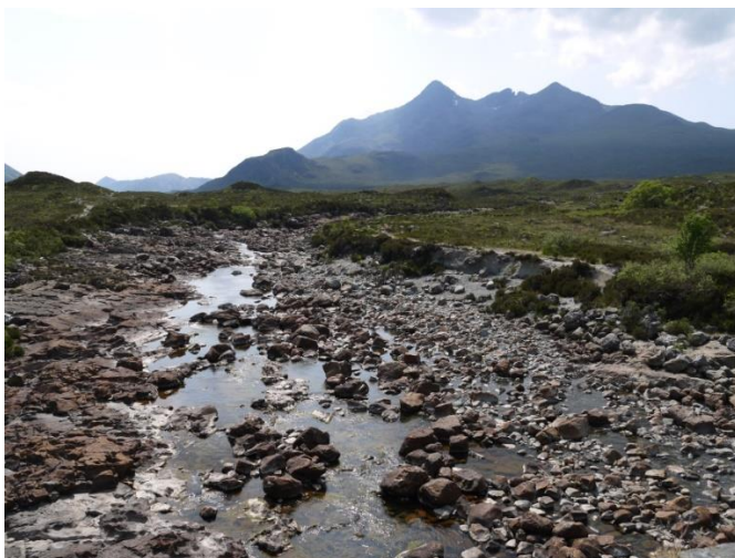
The Cuillins on Skye, the "Misty Isle"