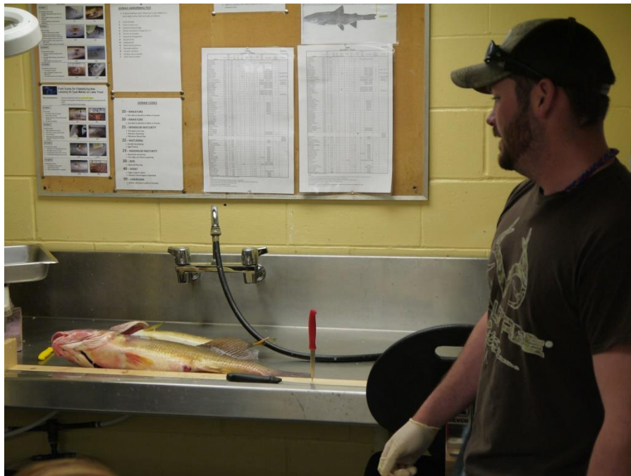
Glenora Fisheries Research